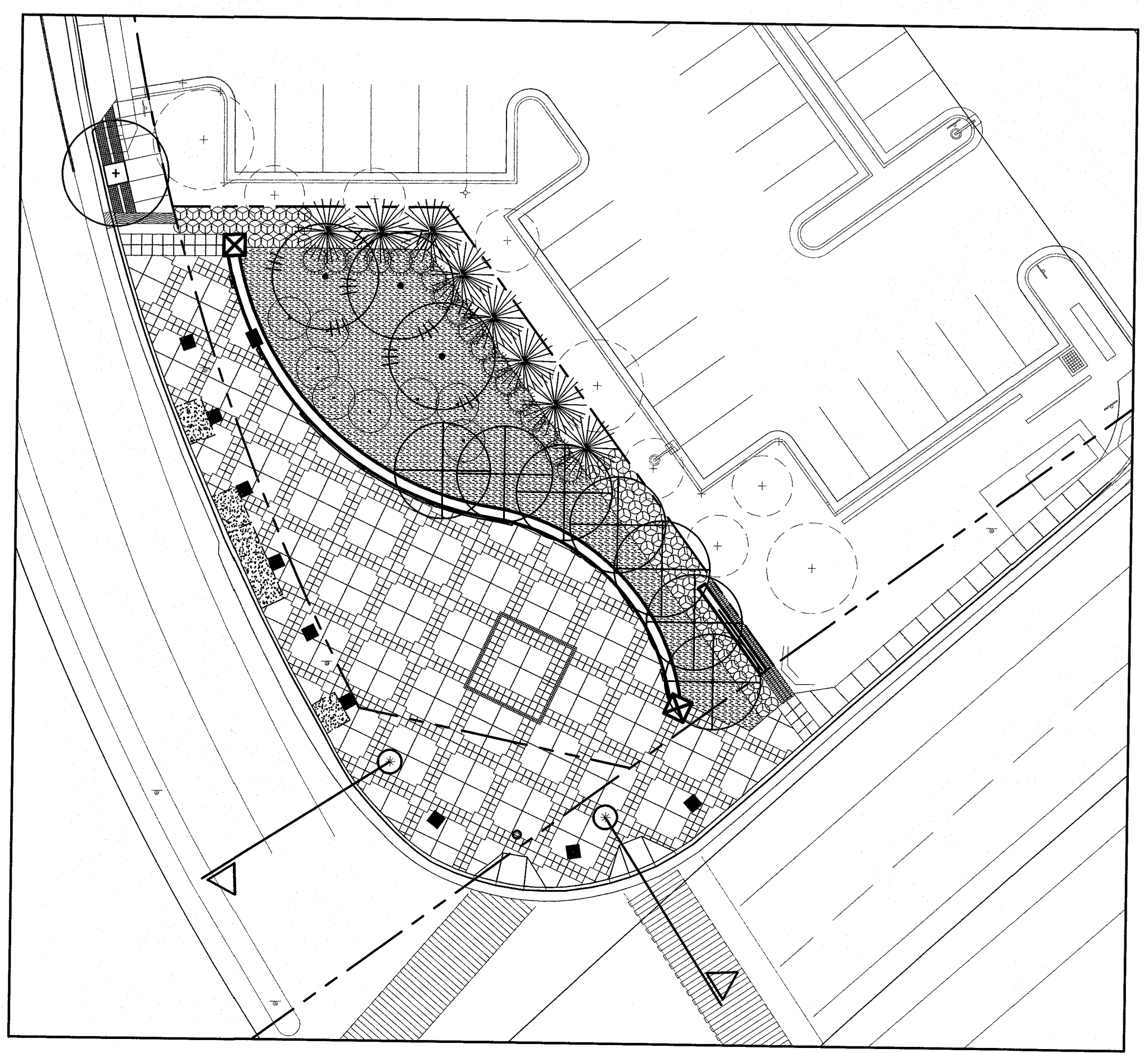
SITE MAP 1" = 40'